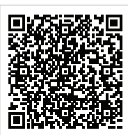
Port State Control Guidelines

The Sub-Committee on Pollution Prevention and Response (PPR) is undertaking a review of the 2015 Guidelines on Exhaust Gas Cleaning Systems (EGCS). The sixth session of the Sub-Committee (PPR 6) noted the progress made by the Correspondence Group on review of the 2015 EGCS Guidelines and requested an extension of the target completion year to 2020 with a view to continuing the work on the