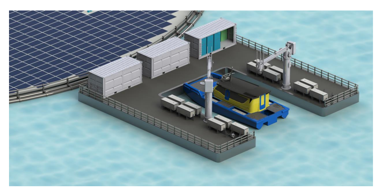
(Please credit the image to Yinson Green Technologies & SeaTech Solutions.)

• Artist impression of the Shift swappable batteries: