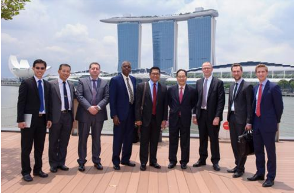
Group photo in front of the iconic Marina Bay Sands

The MPLP Alumni Gathering provided the MPLP alumni with an opportunity to reminisce with their course mates and also to network with alumni from different runs of the MPLP. The SMW events were also invaluable opportunities to discuss issues and developments in the maritime industry, as well as to network with maritime administration and maritime industry representatives.